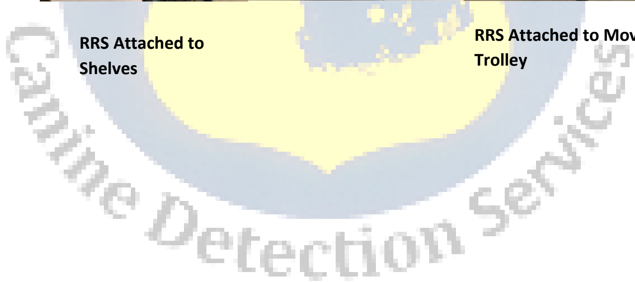
RRS Attached to Moving Trolley