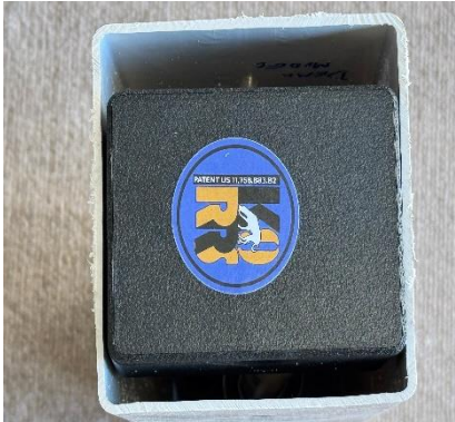
Control Box. (1)