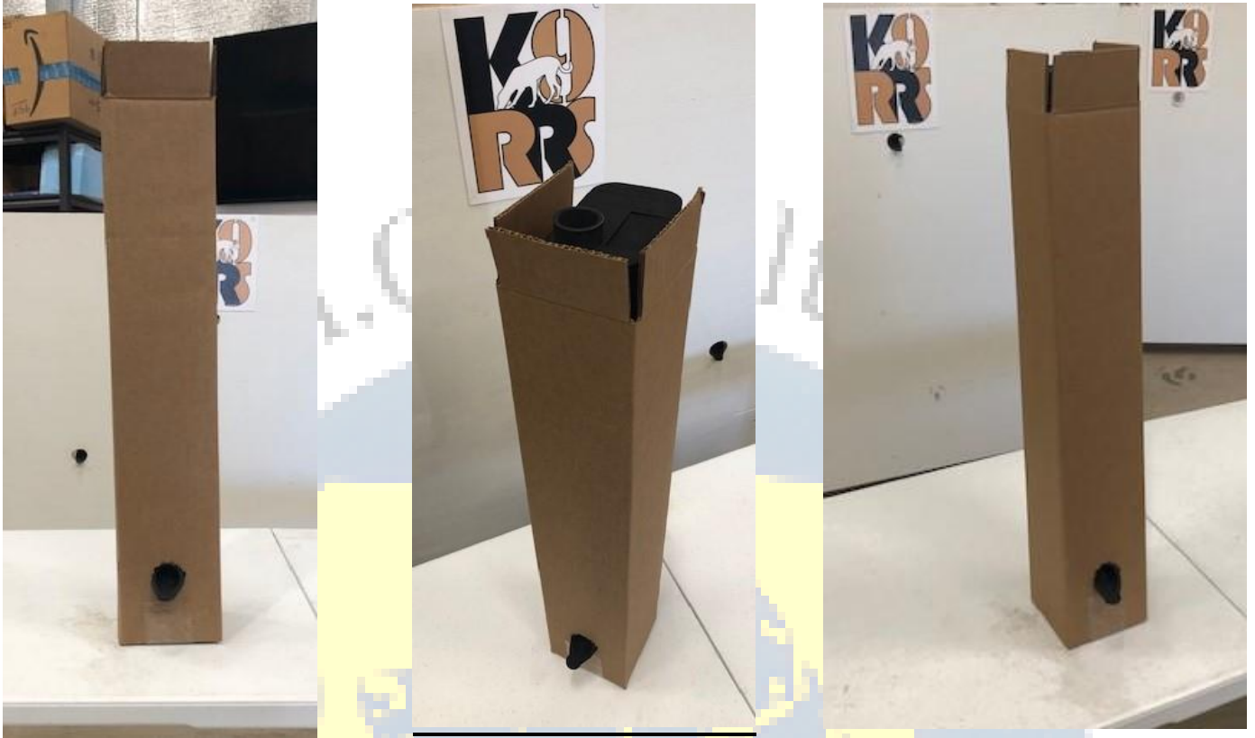
Photos showing shipping box with K9-RRS inserted for training.