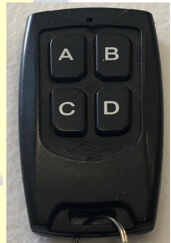
Remote Transmitter. (1)