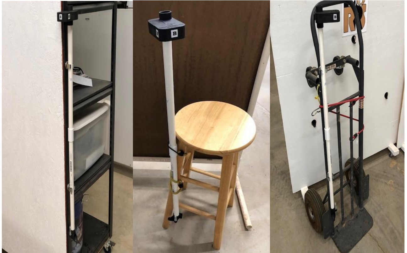
RRS Attached to Shelves