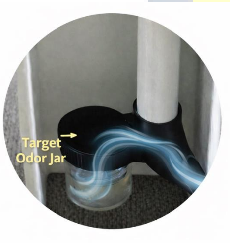
Odor Shoe (1)