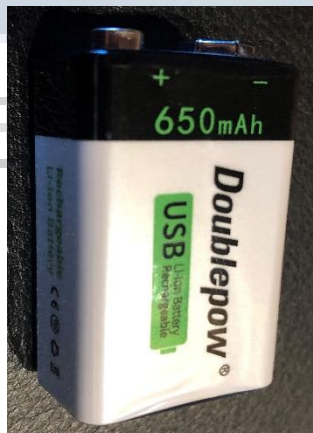
9V rechargeable Battery. (1)

Do Not discard Shipping Box ! You will use the shipping Box for a concealment device during your training.