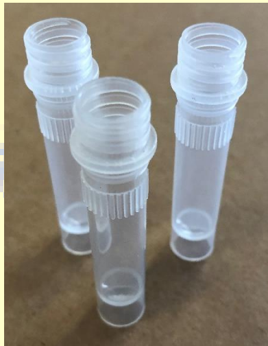
Odor Tubes (3)