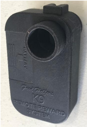
Control Box. (1)