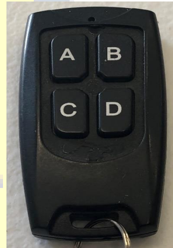
Remote Transmitter. (1)