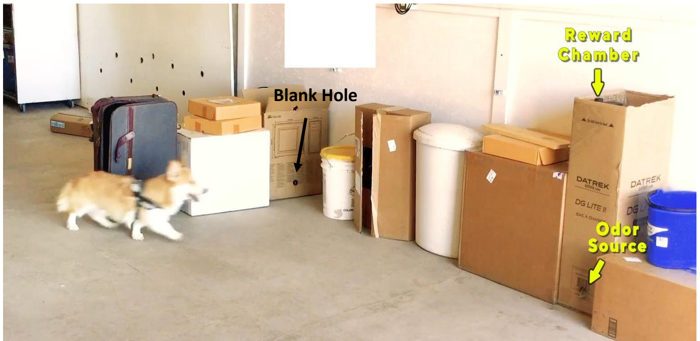
Using different boxes to conceal the K9 RRS device.