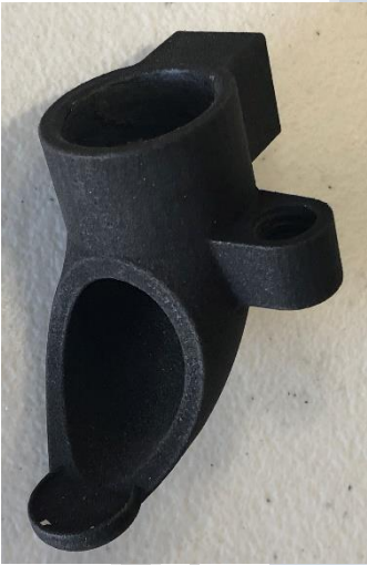
Odor Shoe. (1)