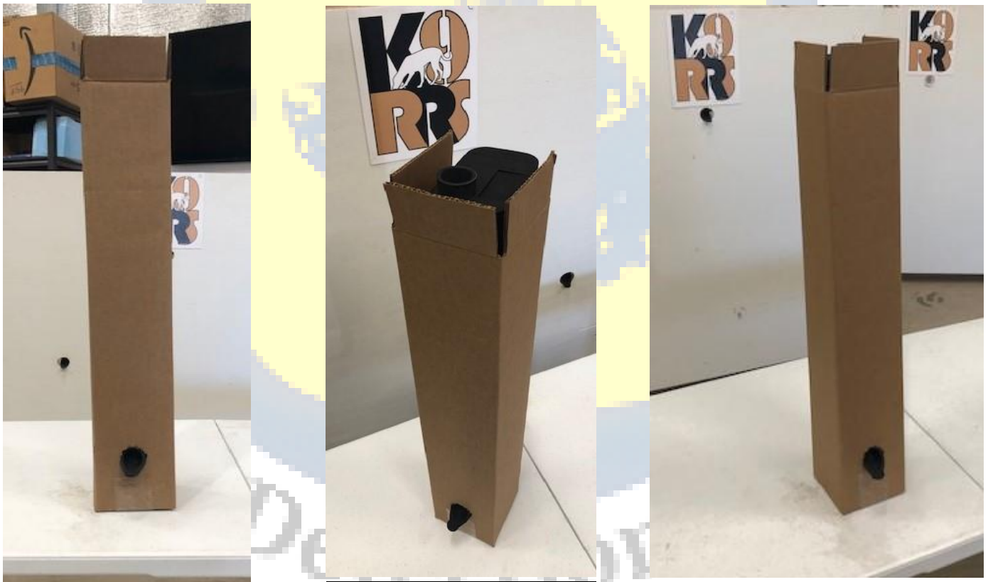
Photos showing shipping box with K9-RRS inserted for training.

Remember to place the odor shoe located in the concealment container at head height so that the food reward located in the control box will be beyond the reach of the dog. (On chair, shelf, or placed on another box etc.)