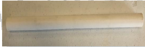
Delivery Tubes. (2)